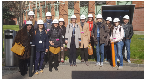
Company visit at Lonza Visp.

Presentations, Networking, Celebration: 28 January 2021