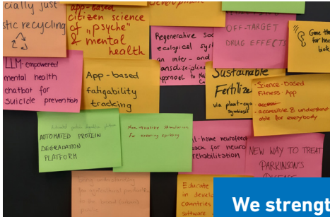
feminno participants ideas after 2-days Innovation Workshop, October 2024.

We strengthen your career competencies on the basis of your own resources.