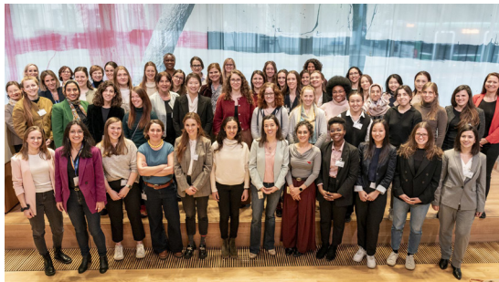
Company visit at ROCHE, February 2025.

Please note: All workshops will be held in person, in Zurich.