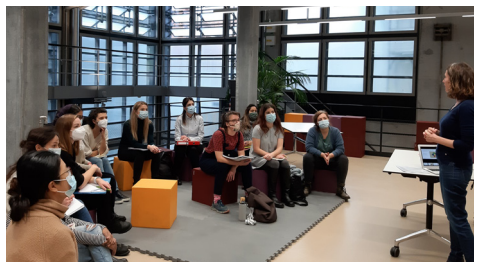
Value-Based Design Workshop, December 2021.

Please note: we try to hold our workshop in person, some seminars may be hold virtually.