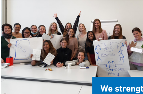
feminno participants fully energized after 2-day Innovation Workshop, October 2021.

We strengthen your career competencies on the basis of your own resources.