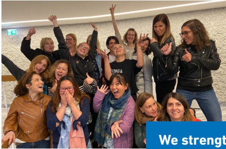
feminno participants empowered after a 2-day negotiation training.

We strengthen your career competencies on the basis of your own resources.