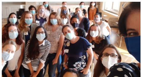
Career Retreat in September 2020.

Please note: we try to hold our workshop in person, some seminars may be hold virtually.